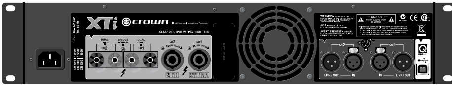
XTi 1000, 2000, 4000 back panel